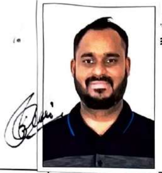
A of Indian Registration Act, 1908 aimant sheet signature